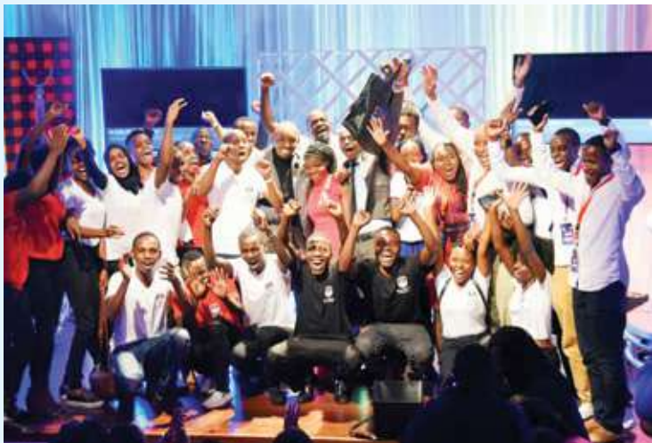
Award-winning journalism students, their colleagues and staff celebrate the win.

Of the investigative pieces that the 20 participating universities presented, the trio's story, 'Taps of Misery', edged the rest.