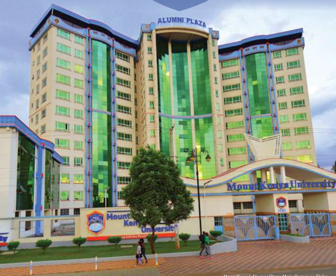
Magnificent Alumni Plaza Main Campus, Thika