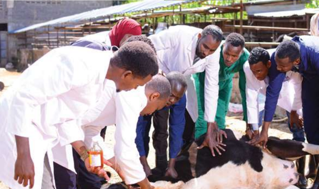
Students from department of animal health and production during their practical lesson at the field. MKU Nakuru campus is the centre of excellence for all animal health and production programs