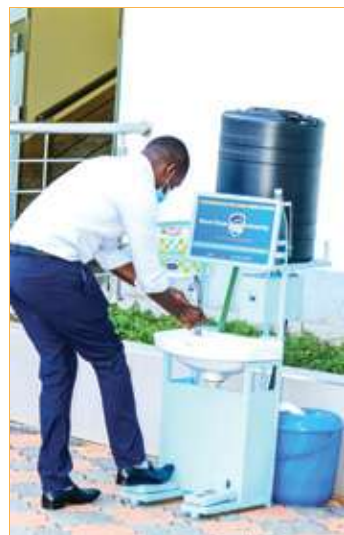
A member of staff washing hands using a contamination free hand wash station

Ministry of Education officials led by Education Cabinet Secretary Prof. George Magoha (Centre) Inspect Mount Kenya University to assess level of preparedness and compliance with the Ministry of Health Covid-19 preventive and containment measures. CS Magoha noted that MKU was among the two universities that had made great progress and was given a clean bill of health for face-to-face teaching & Learning.