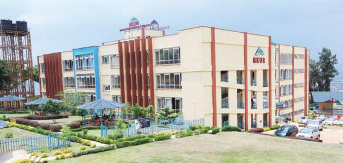
Proposed Mount Kigali University of Technology Republic of Rwanda