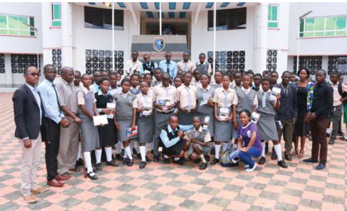
High school students during their career and mentorship visit at Mount Kenya University, Thika Main Campus