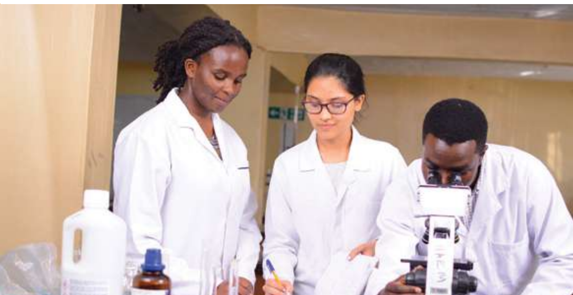
Mount Kenya University students during a practical lesson at one of the state-of-art laboratories. MKU has more than 15 laboratories to meet the need of specialized equipment training.